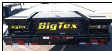
Center Pop-Up Dovetail