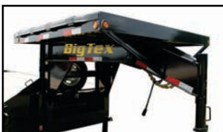
Deck on Neck